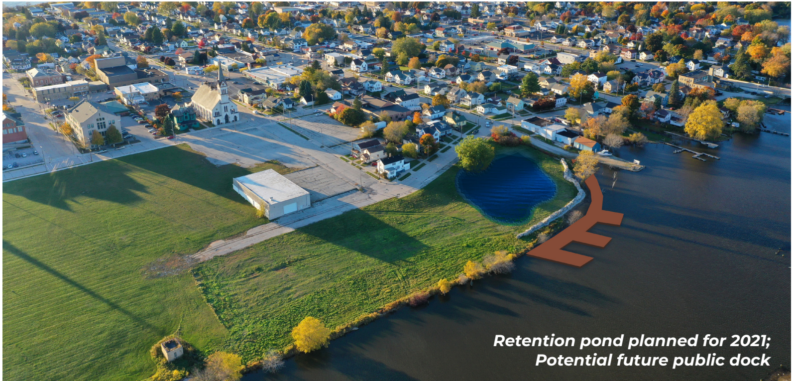
Retention pond planned for 2021; Potential future public dock