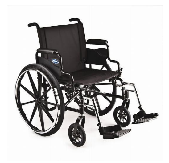
WHEELCHAIR (seat sizes of 18", 20", 22") WITHOUT ELEVATED LEG RESTS.....$40