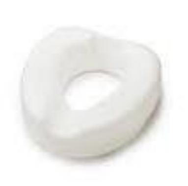
Riser without handles.....$15