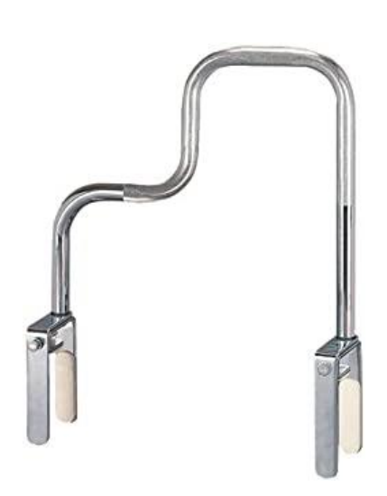
Tub rails..... $15