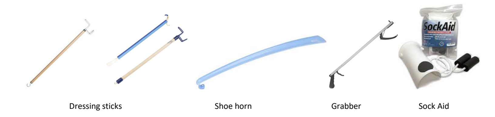
\label{thm:miscellaneous} \mbox{Miscellaneous items......prices vary when grouped together}