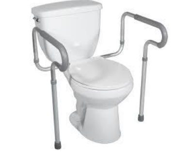
Toilet safety rails.....$15