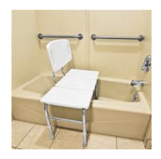
Tub bench..... $15