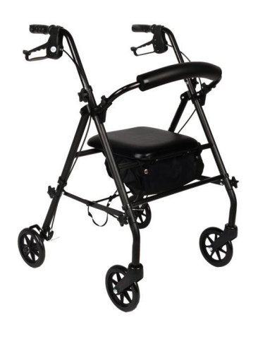
Four-wheel walker.....$15 (standard & bariatric size)