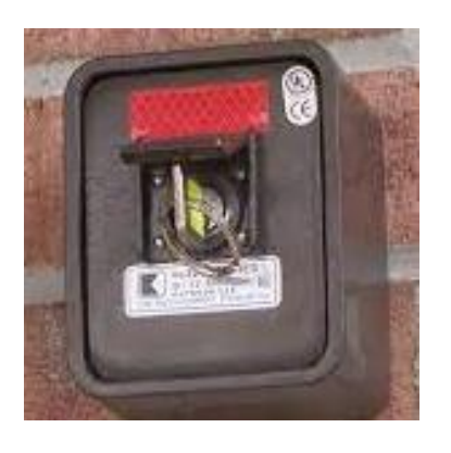
KNOX BOX (holds house key).....$40