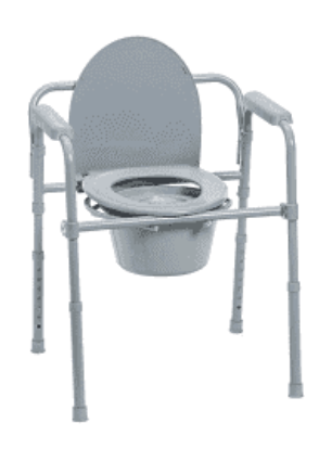
Standard Commode without pail.....$15 with non-returnable/non-refundable pail.....$20