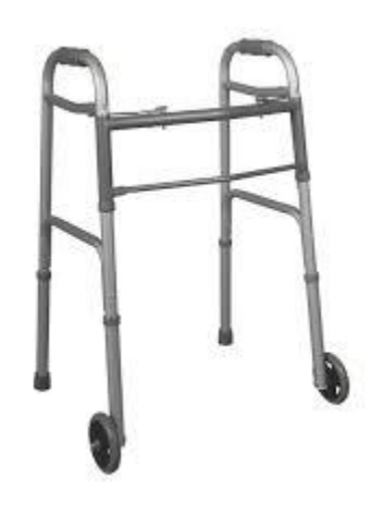
Two-wheel walker.....$15 (standard & bariatric size)