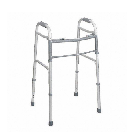
No-wheel walker.....$15 (standard & bariatric size)