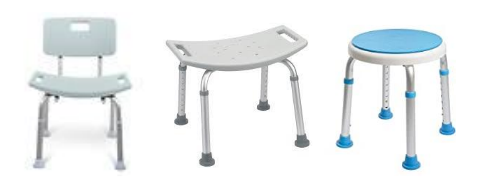
Tub chair with back or without back and no handles..... $15