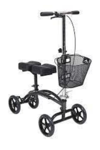
KNEE SCOOTER (300 lb to 350 lb weight capacity.....$40