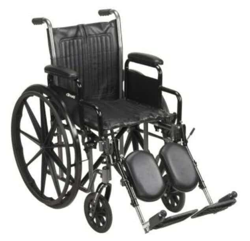
WHEELCHAIR (seat sizes of 18", 20", 22") WITH ELEVATED LEG RESTS......$40