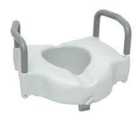
Riser with handles.....$15