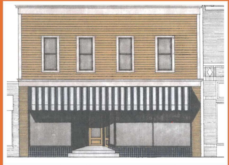
Preliminary Concept for Façade