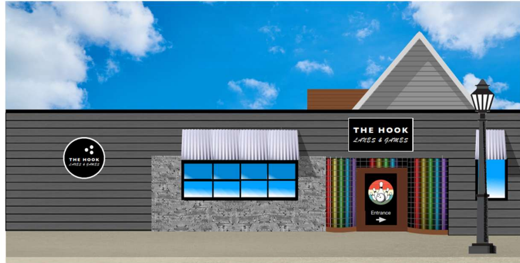
THE HOOK FACADE PLAN

Legacy downtown bowling alley, seeing major reinvestment. Façade grant $25,000 City/$5,000 TR Main Street toward a total façade project of at least $60,000