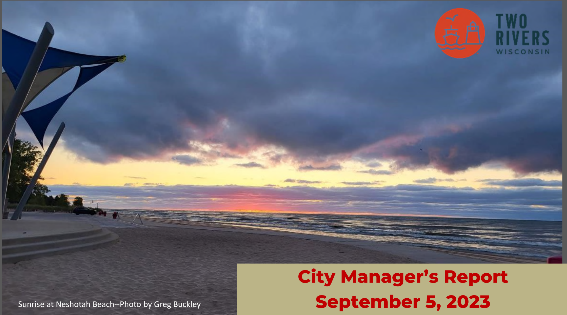
Sunrise at Neshotah Beach