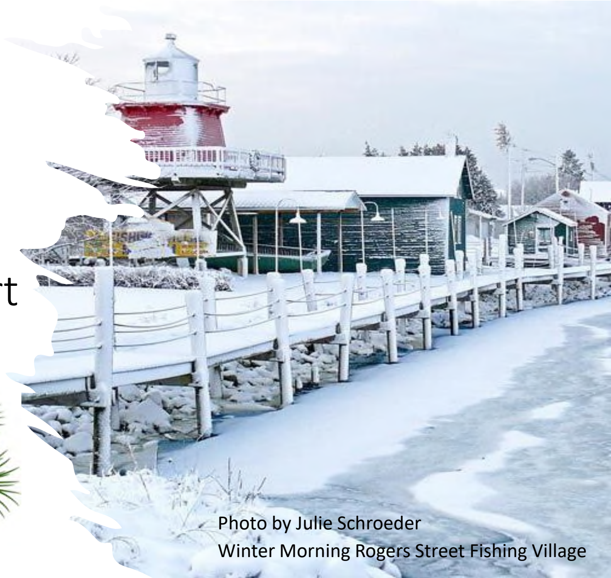
Winter Morning Rogers Street Fishing Village