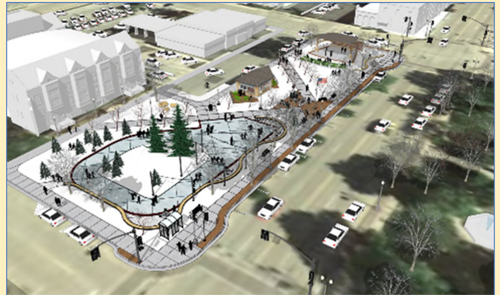
Above renderings are Summer and Winter views from the southeast; for more information on the Central Park West 365 Project, go to www.two-rivers.org