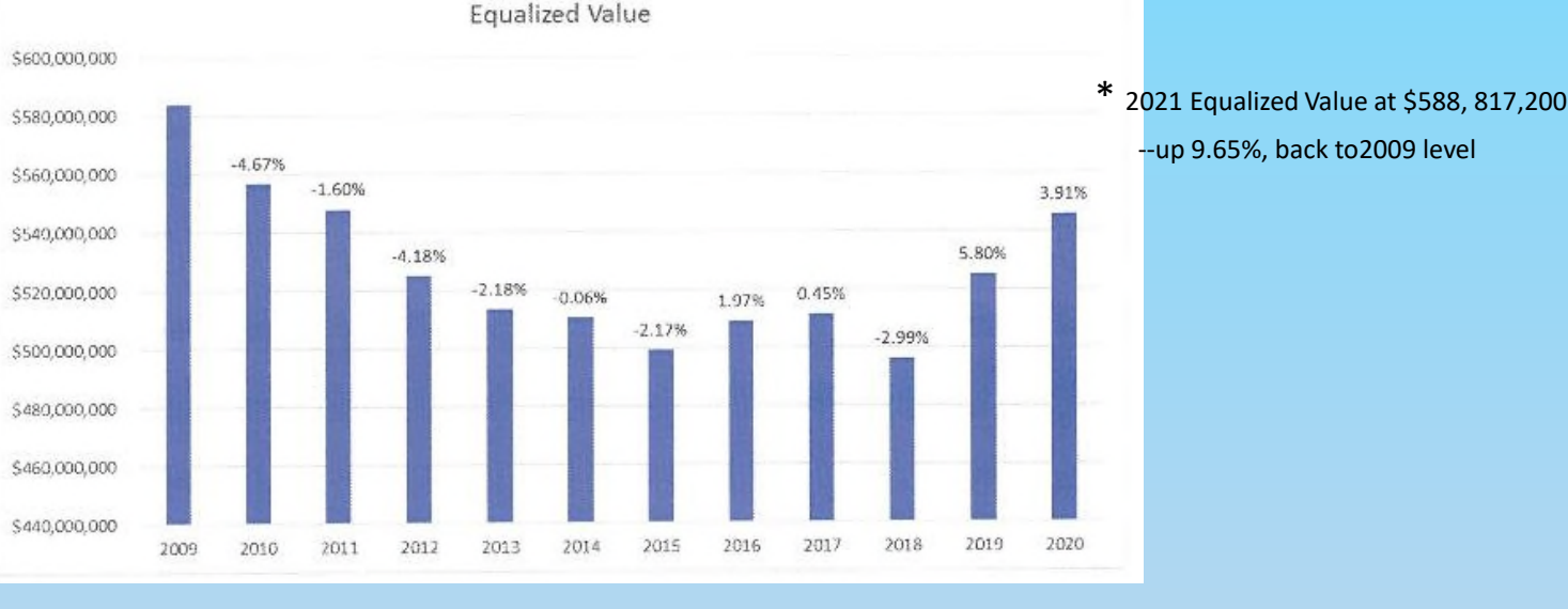
Chart and comments at right are from 2020 City Audit Report, Mgt. Discussion and Analysis

The City's Equalized Value for 2020 is the highest it has been since 2011, when we were feeling the impact of a recession. Equalized value had increased an average of 3% annually from 2005 to 2009. The recession of 2008 had an adverse impact on the local tax base, reflective of the declines experienced in other areas of the state and nation. Total Equalized Value, dating back to its high point in 2009, is as follows: