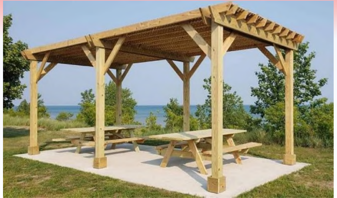
Pergola Completed, With Furnishings