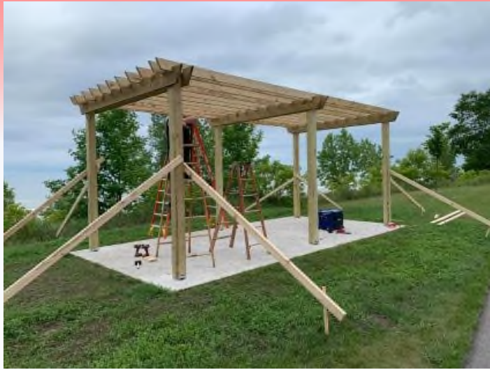
Pergola, Nearing Completion