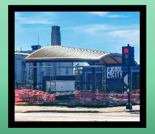
Schmitt Brothers Stage