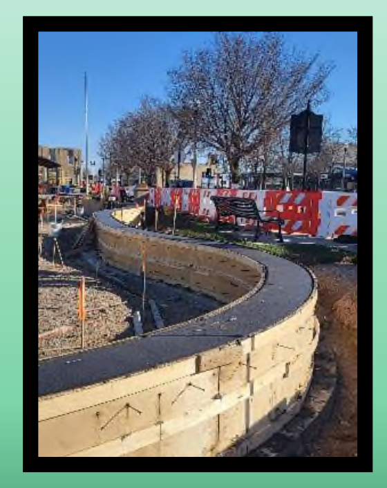
View from south end of park, showing seating wall