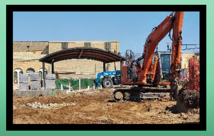
Foundation for new pavilion building