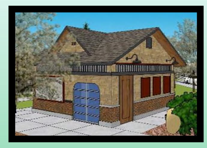
Elevation of new pavilion building