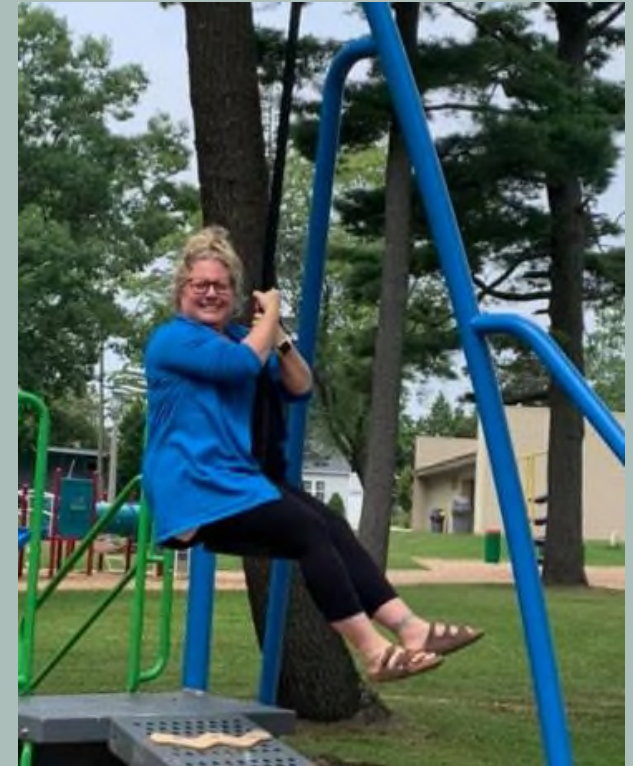
Test Run on the New Zipline At Neshotah Park