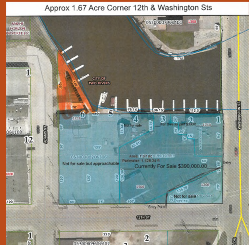
Proposed Redevelopment Site (does NOT include Screamin' Conuts property)

(2.) Staff is pursuing possible amendment to Tax Incremental District 12 (Hotel TID, created in 2018) to assist project