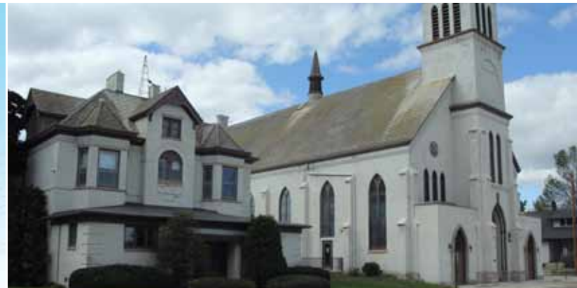
Former St. Lukes Rectory Former St. Luke's Church 1814 Jefferson St, Two Rivers, WI 1820 Jefferson St, Two Rivers, WI

Don't miss this opportunity to own these outstanding properties!