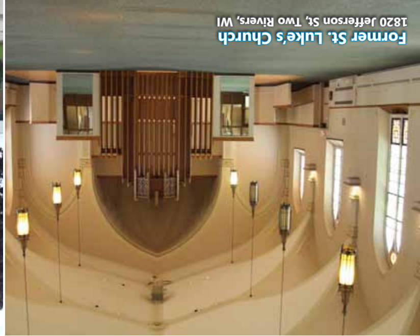
Former St. Luke's Church 1820 Jefferson St, Two Rivers, WI