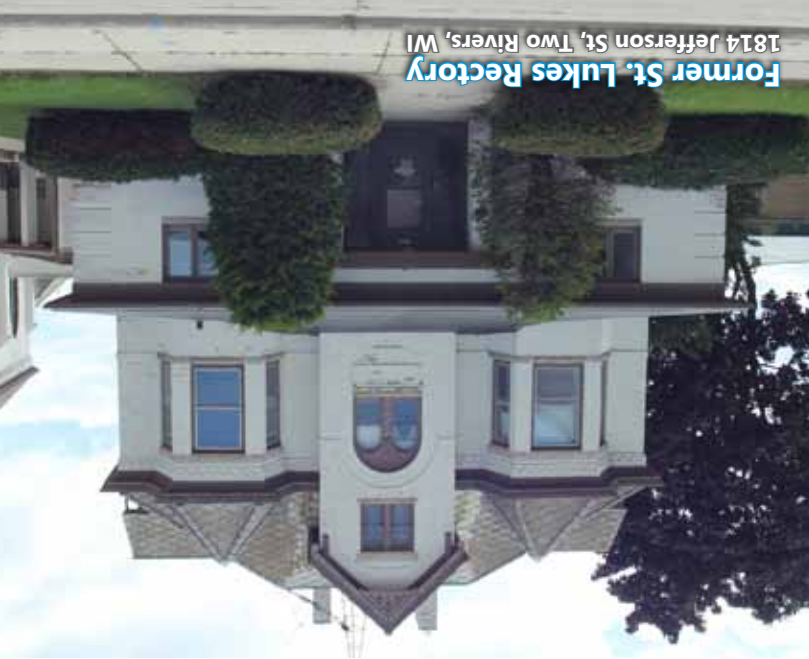
Former St. Lukes Rectory 1814 Jefferson St, Two Rivers, WI